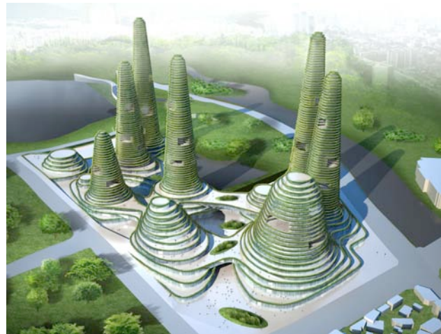
Fig.4 MVRDV Gwangyo Poxwer Centre near Seoul