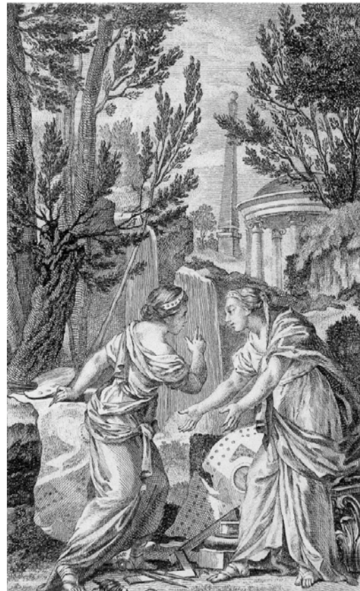
Fig. 2 Allegories of the natural and architectural style in the Frontispice of Jaques Delille's Les jardins ou l'art d'embellir les paysages op.cit. 3

seems quite intense. Just before the French Revolution, in a period of the decline of the French formal garden and at the rise of the English landscape garden, we can easily imagine passionate quarrels of the anciens and the nouveaux. One could almost tell that the two allegories of Geometrical Style and Architecture on the right side of each etching in Delille's and Laugier's books are sisters or one person. We might even recognize a resemblance of the faces - or it is their idealness that makes them look similar? In any case the next step of the development of landscape was away from the architectural towards the imitation of nature. Paysagisme was emancipating itself from architecture and we could fix that moment in history quite precisely to the appearance of this etching.