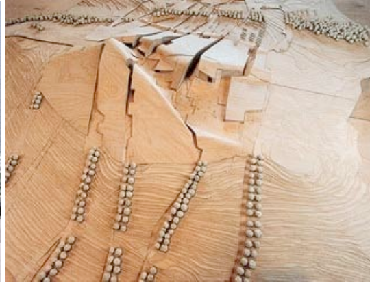
Fig. 6 Eisenman City of Culture Galicia