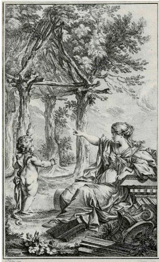
Fig.1 Genius and Architectura in the Frontispice of Marc Antoine Laugier Essay sur l'architecture op.cit. 2