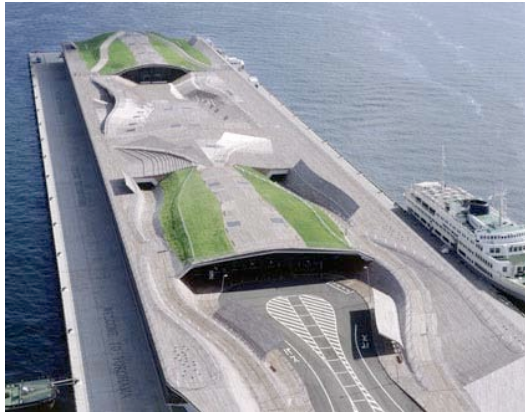
Fig. 5 FOA Yokohama Ferry Terminal