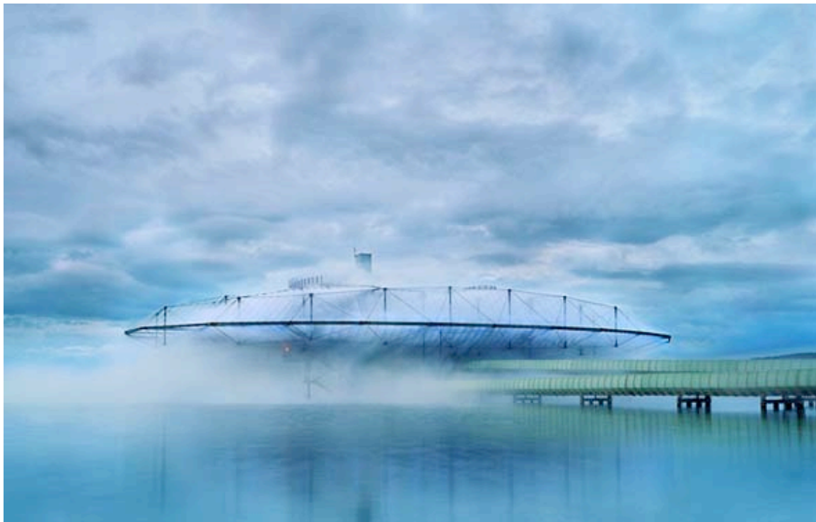
Fig. 7 Diller & Scofidio Blur Building Expo.02 Yverdon-les-Bains

It is not disputable that the theoretical work of Peter Eisenman has had a great influence on contemporary architecture. Eisenman is known for his, sometimes quite specific interpretations and adoptions of contemporary philosophy for architecture and for eloquent critique of modernism. His build work is always strongly related to theoretical concepts. The mind-driven structures might even lack a relation to the human body. The City of Culture of Galicia might become Eisenman's most powerful work, creating a whole landscape out of one's mind might overcome the gap to the human experience. It seems like landscape metaphor is introduced in the design not only in relation to the site but also to give visitors a clue to understand the complexity of the enormous composition. We can hope that the visitor's experience will not only be one of scale and monumentality but also touch the viewer's soul.